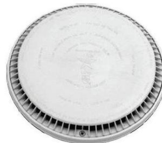
Anti-vortex drain cover