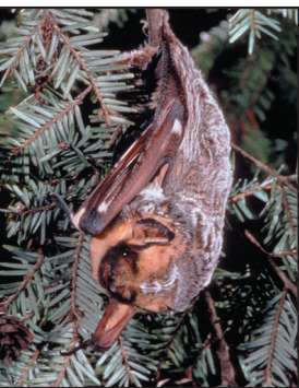
Hoary Bat ( Lasiurus cinereus )

Most of the recent human rabies cases in the United States have been caused by rabies virus from bats. Awareness of the facts about bats and rabies can help people protect themselves, their families, and their pets. This information may also help clear up misunderstandings about bats.