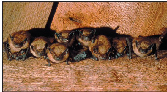
Big Brown Bat ( Eptesicus fuscus )

If you see a bat in your home and you are sure no human or pet exposure has occurred, confine the bat to a room by closing all doors and windows leading out of the room except those to the outside. The bat will probably leave soon. If not, it can be caught, as described, and released outdoors away from people and pets.