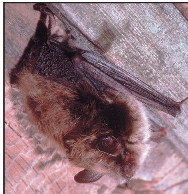
Little Brown Bat ( Myotis lucifugus )

Yes. Worldwide, bats are a major predator of night-flying insects, including pests that cost farmers billions of dollars annually. Throughout the tropics, seed dispersal and pollination activities by bats are vital to rain forest survival. In addition, studies of bats have contributed to medical advances including the development of navigational aids for the blind. Unfortunately, many local populations of bats have been destroyed and many species are now endangered.