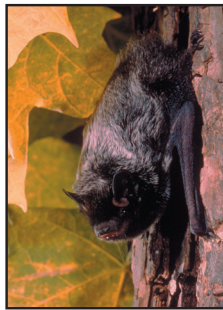
Silver-haired Bat ( Lasionycteris noctivagans )

People usually know when they have been bitten by a bat. However, because bats have small teeth which may leave marks that are not easily seen, there are situations in which you should seek medical advice even in the absence of an obvious bite wound. For example, if you awaken and find a bat in your room, see a bat in the room of an unattended child, or see a bat near a mentally impaired or intoxicated person, seek medical advice and have the bat tested.