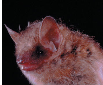
Eastern Pipistrelle ( Pipistrellus subflavus )

securely, and punch small holes in the cardboard, allowing the bat to breathe. Contact your local health department or animal-control authority to make arrangements for rabies testing.