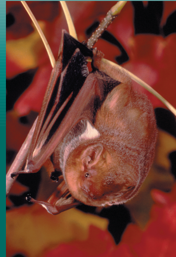
Eastern Red Bat ( Lasiurus borealis )